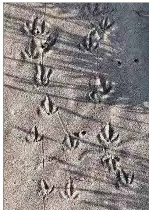
Paw prints of Collared Pratincole, Gruissan, July 2025