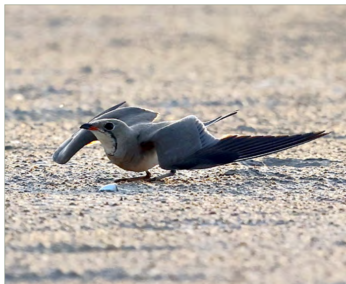
Collared Pratincole, alarm posture, Gruissan, July 2025