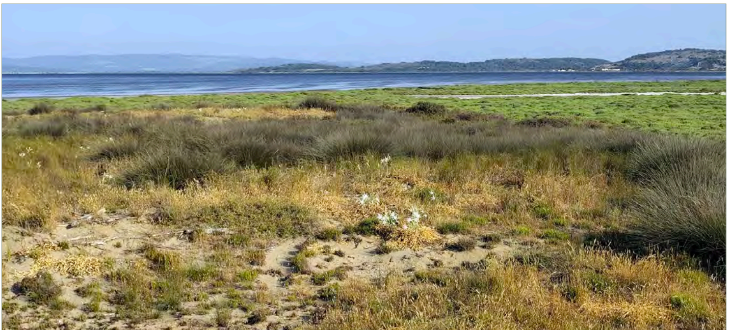
Breeding site of the Collared Pratincole in Gruissan, Aude, July 2025

• 1 July (with C. Clairotte ) - We conduct a survey of Kentish Plovers on Vieille Nouvelle beach south of Gruissan (Aude), a beach that has finally been closed to motor vehicles after many years of campaigning to enforce the law. After discovering a few pairs, some brooding and others accompanied by chicks, we decided to continue on to Grau de la Vieille Nouvelle to complete our inventory.