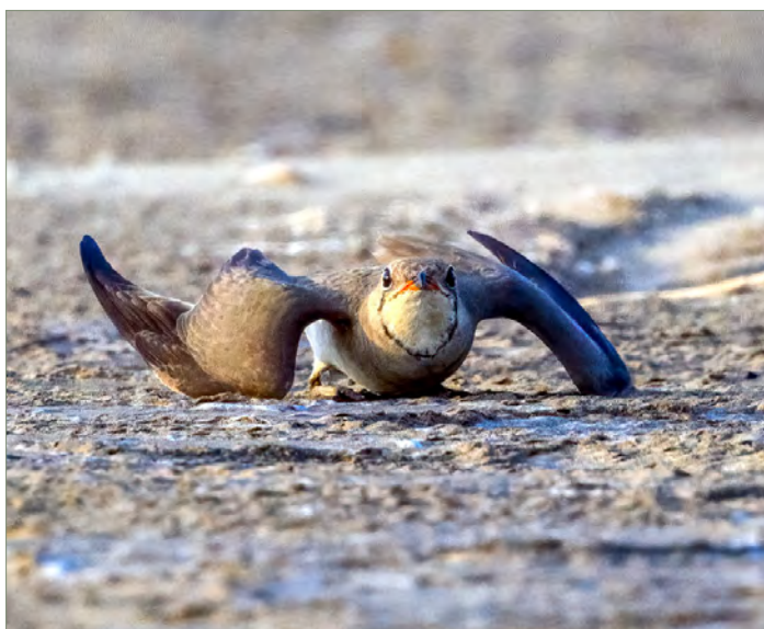
Collared Pratincole, alarm posture, Gruissan, July 2025

The two pratincoles land on the sand a little further away and one holds its wings outstretched, a classic posture for a wader with a nest or young nearby, seeking to divert the attention of a potential predator (breeding code 11). We keep our distance while the two birds stand motionless on the sand. After watching them from afar for about thirty minutes, we decide to leave.