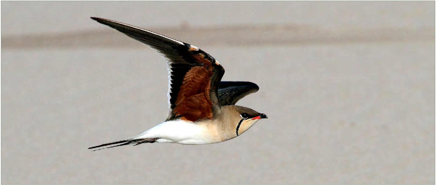
Collared Pratincole, Spain, May 2010 (© Christian Aussaguel 1 )

During the summer of 2025, a pair of Collared Pratincoles bred on Gruissan beach in the Aude department, far from the Camargue colonies. This is the first confirmed case of reproduction (breeding codes 11 and 16) for this department in Languedoc region.