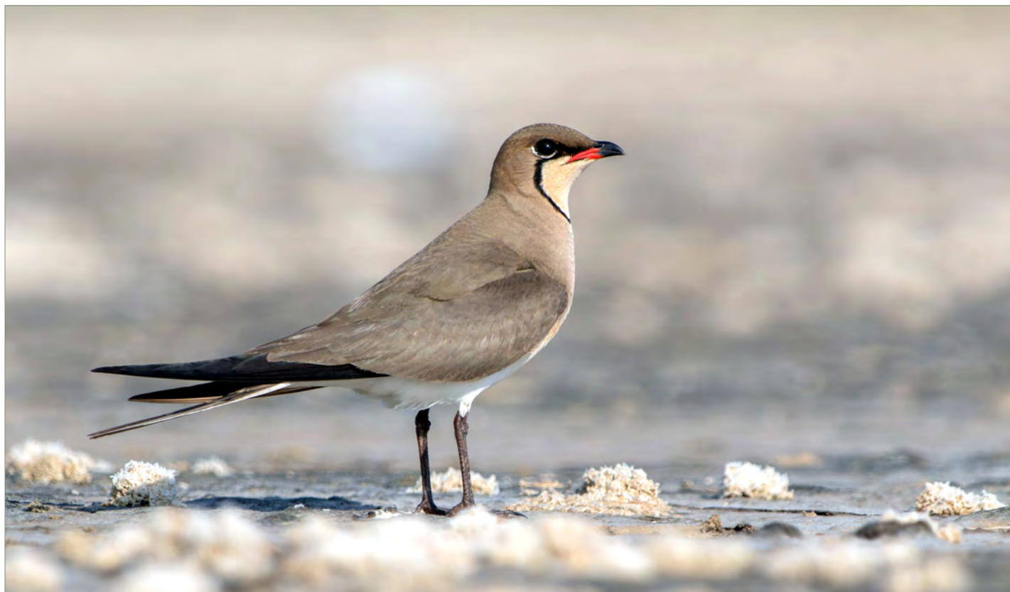
Collared Pratincole, Greece, May 2023