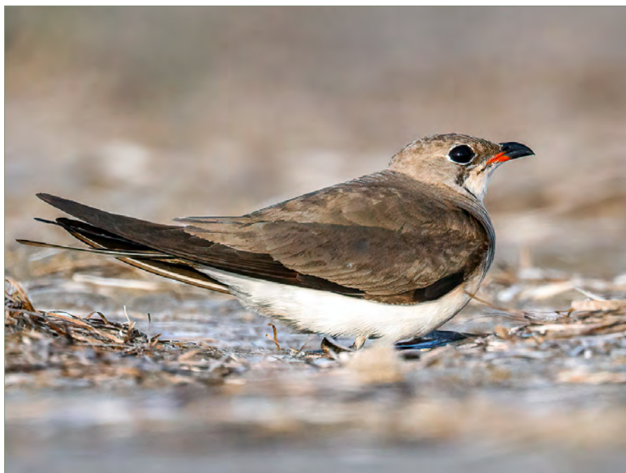
Collared Pratincole, Gruissan, July 2025